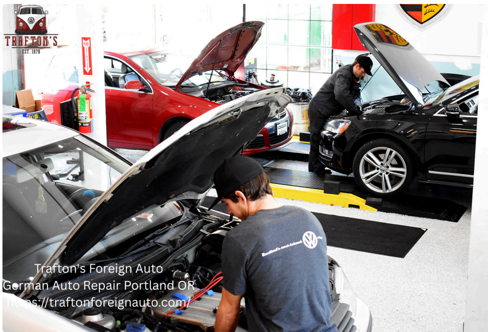
Trafton's Foreign Auto German Auto Repair Portland OR https://traftonforeignauto.com/

For a Portland driver hunting terms like German Service Portland OR or German Engine Rebuild Portland OR, the realistic circulate is to model department shops by means of verified suit, not through who lists the most features. The broader your hindrance, the extra you should still care about diagnostic constitution. The extra proven your engine ruin is, the more you needs to care approximately direct rebuild sense.